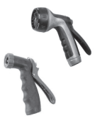
Garden Hoses & Spray Nozzles