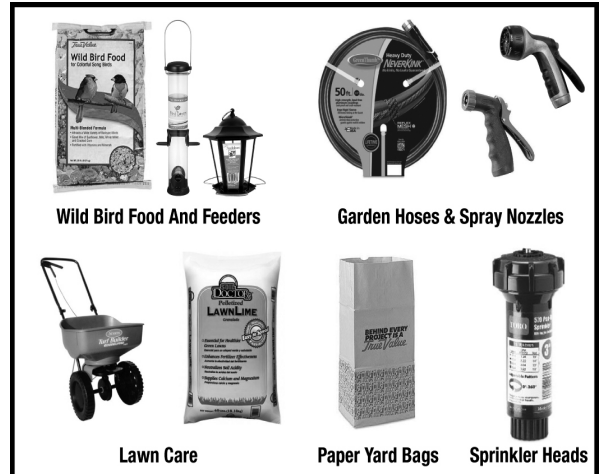
Wild Bird Food And Feeders