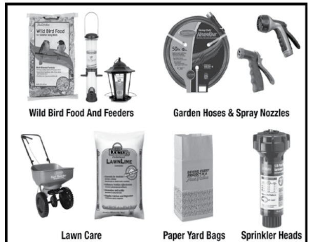
Wild Bird Food And Feeders