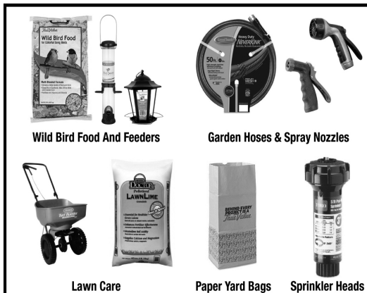
Wild Bird Food And Feeders