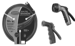
Garden Hoses & Spray Nozzles