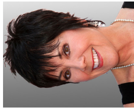
Starring Joyce DeWitt

It's Back! A sidesplitting cross between The Golden Girls and The Hangover"