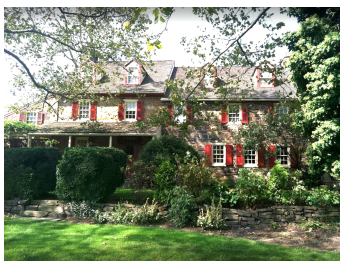
Joseph Ambler Inn