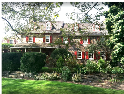
Joseph Ambler Inn